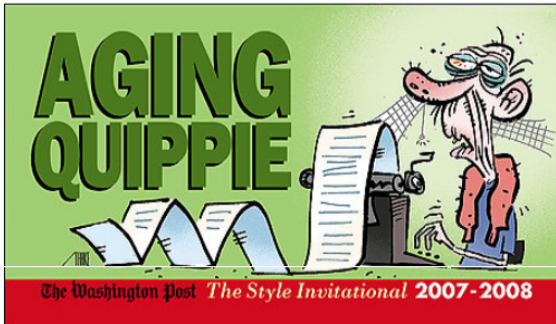
Tom Witte, Montgomery Village

We introduce the 2007-08 lusted-after Style Invitational Magnets for honorable mentions, created as always by The Invitational's own Bob Staake. The texts were submitted as entries for the recent contest to decorate the Loser T-shirt and mug. We may go back to the same well for next year's slogans, but other ideas are always welcome in the interim.